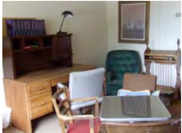
The Dorm Study Room