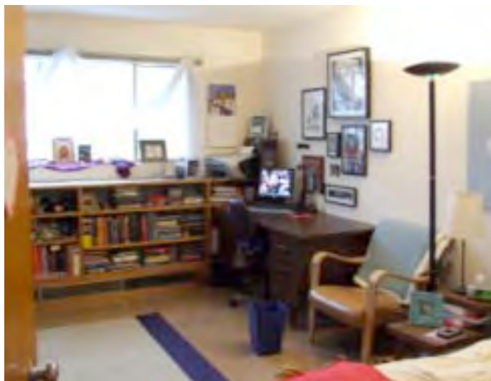
A typical dorm room