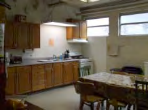
The Dorm Kitchen