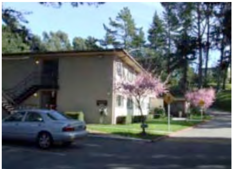
Beasom in the spring

Dormitory residents must make a refundable cleaning and security deposit of $300 which is due at or before the first academic semester of residency.