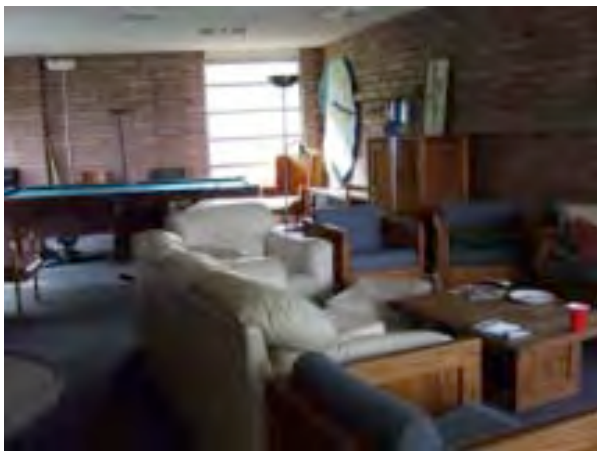
The Dorm Living Room